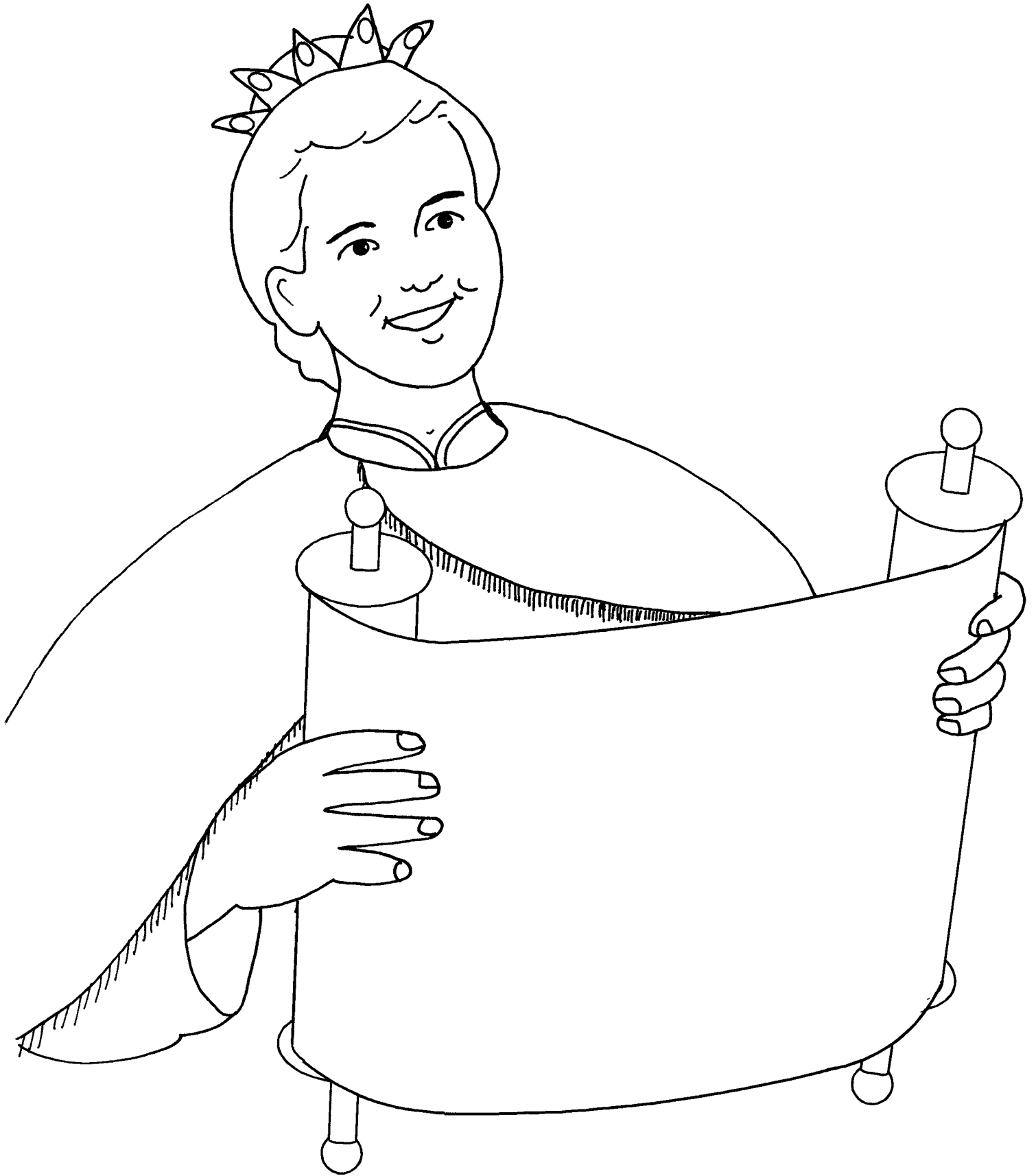
King Josiah read the Book of the Law to the people