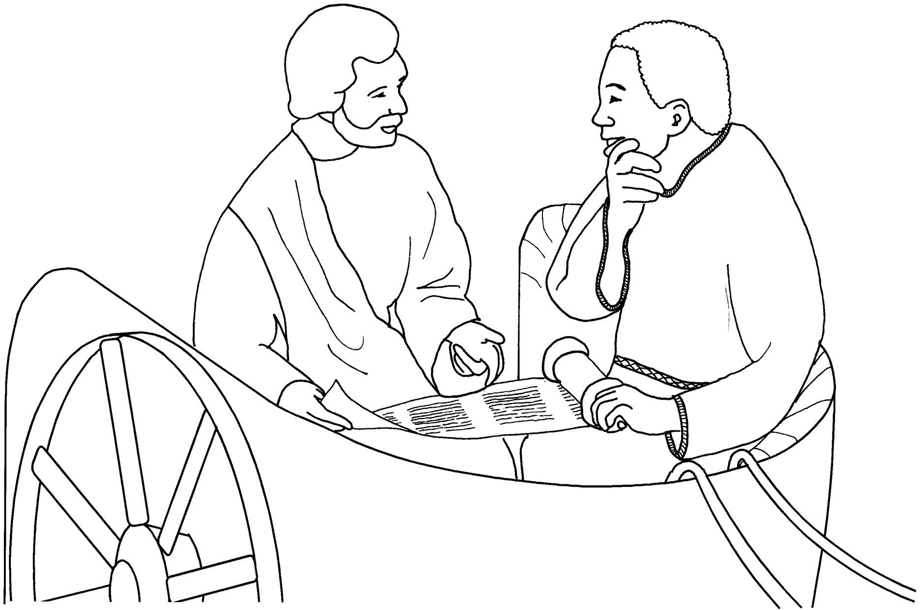
Philip told the Ethiopian man about Jesus